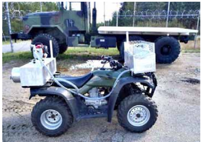
ATV's for the Machiasport Fire Department.